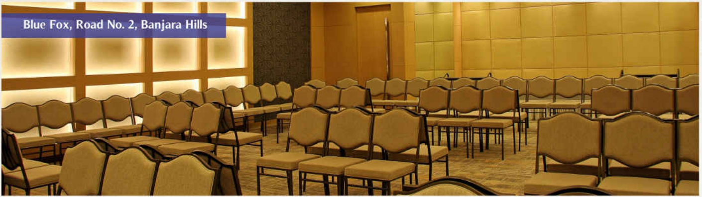
Blue Fox, Road No. 2, Banjara Hills