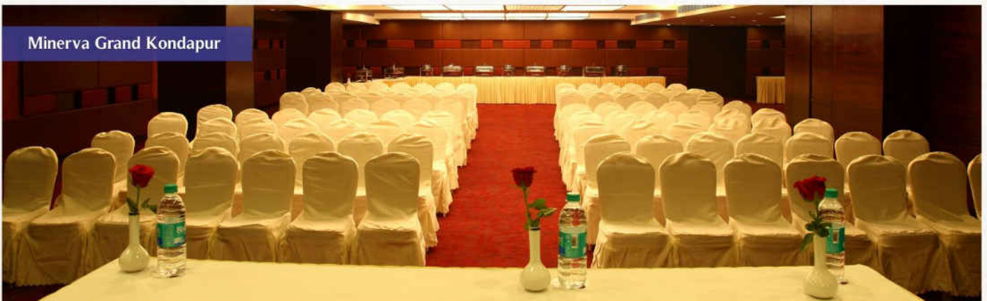
Minerva Grand Kondapur