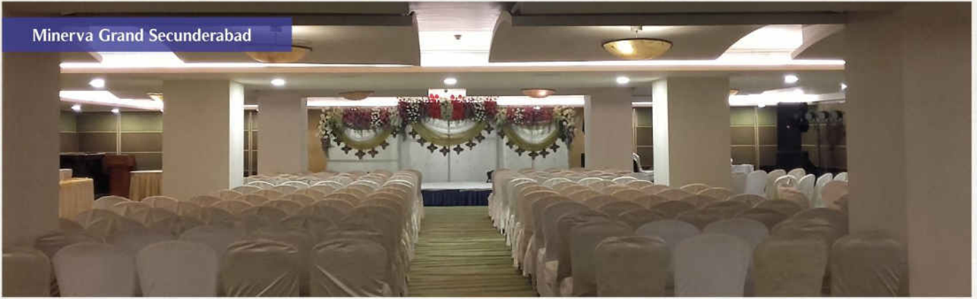
Minerva Grand Secunderabad