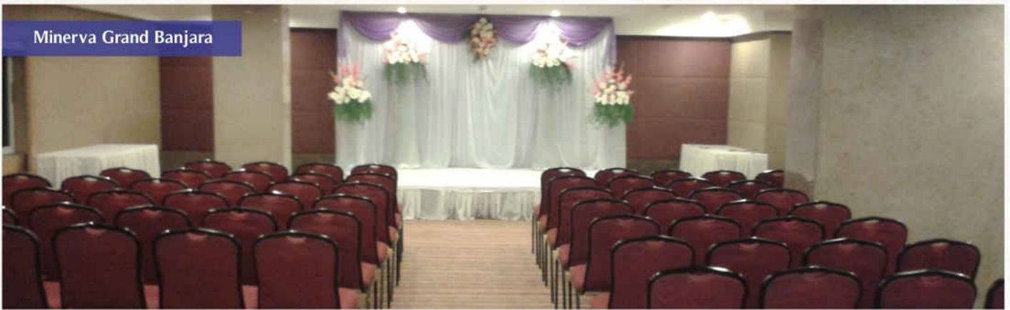
Minerva Grand Banjara